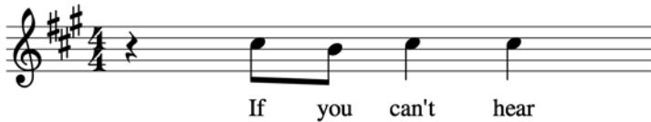
Theme X in “Blurred Lines”