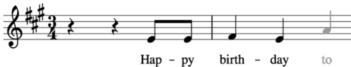
Theme X in “Happy Birthday to You”

The pitches and rhythm of Theme X in the deposit copy are identical to those sung to “Happy Birthday” and numerous other songs. None of the Theme X pitches in the