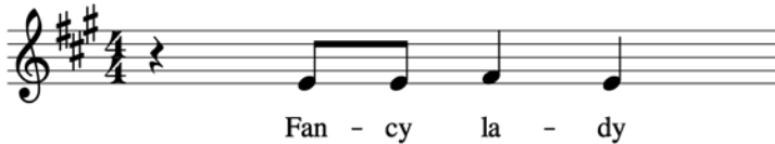
Theme X in “Got to Give It Up”

Theme X refers to another four-note melodic sequence. In the deposit copy, Theme X is sung to the lyrics “Fancy lady.” In “Blurred Lines,” it is first sung to the lyrics “If you can’t hear.” Like the Hook Phrase, Theme X is both unprotectable and objectively dissimilar in the two songs.