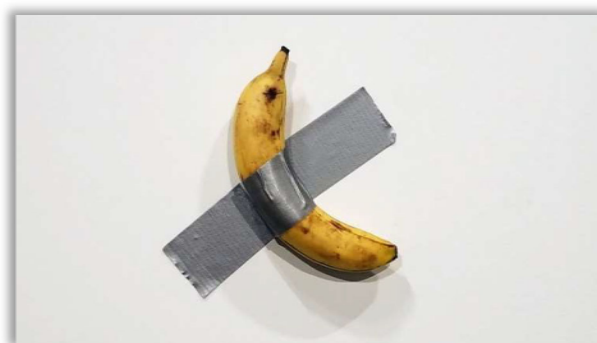
Figure 1: Comedian